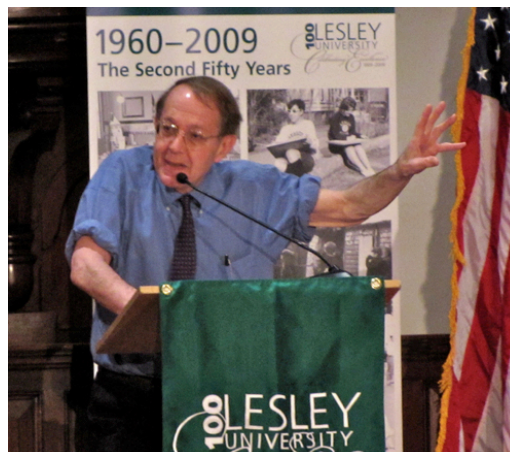
Renowned education reformer Jonathan Kozol delivers a rousing lecture on campus in February. Click here for video of the event!

For more events and other news and features about the Lesley community, visit our website .